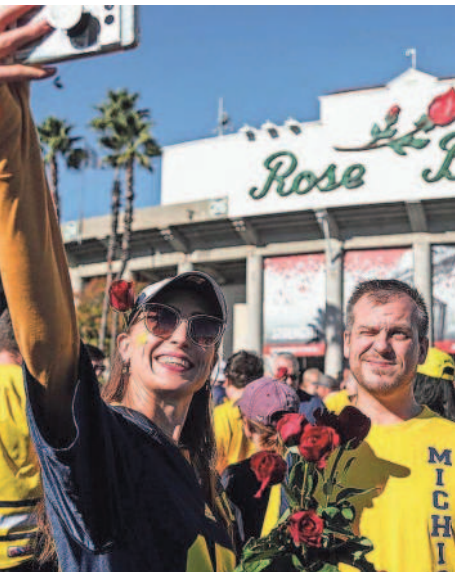
Michigan fans take selfies in front of the Rose Bowl Stadium at the game on Jan. 1 in Pasadena, California.

The Rose Bowl Stadium is known for its traditions and moments, but even the historic venue has to be renovated to help reaffirm its place as a top-end destination in Southern California. While the 102-year-old national historic landmark in Pasadena remains a captivating location for some, it does have to fend off the arrival of SoFi Stadium and the Intuit Dome, which are drawing some of the bigger events to Inglewood. The Rose Bowl was completed in 1922 and has served as the host of Super Bowls and college football championship games, among others. The venue will also host its third Olympic Games in 2028. The Rose Bowl Operating Company and the Rose Bowl Legacy Foundation announced the Lasting Legacy Campaign on Monday morning. It is a revitalization plan for the stadium over the next several years.