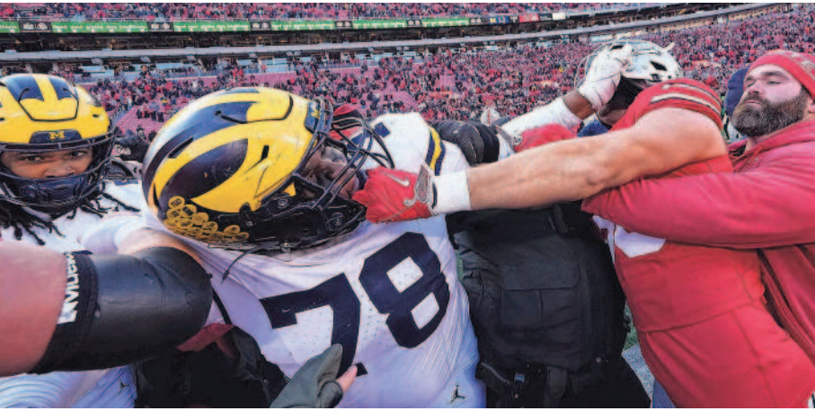
Ohio State Buckeyes and Michigan Wolverines fight following the NCAA football game at Ohio Stadium in Columbus on Saturday. Michigan won 13-10.