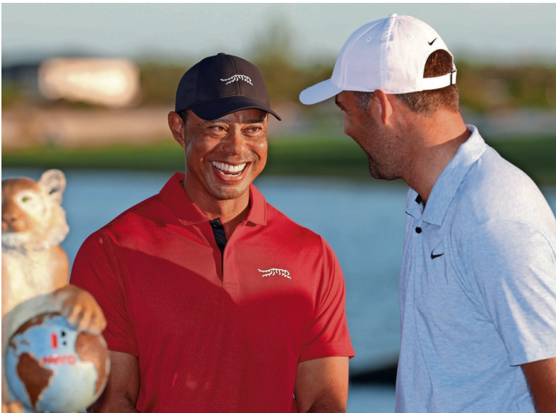
Tiger Woods congratulates Scottie Scheffler after the final round of the Hero World Challenge 2024 in Nassau, Bahamas.

Scheffler opened with 67 and followed with a bogey-free 64 to assume the lead. But he shot a rather pedestrian third-round 69 and trailed Justin Thomas by one stroke heading into the final round. Thomas wedged from 112 yards to 3 feet at the first to protect his one-shot lead. But he made bogeys at Nos. 2 and 5